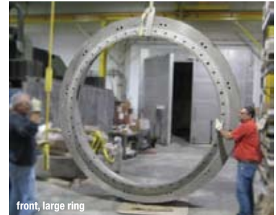
front, large ring

PCT Knowledge. PCT Experience. PCT Proven Performance.