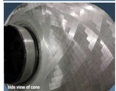
side view of cone