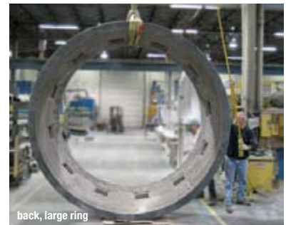
back, large ring