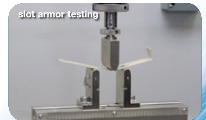
slot armor testing

Call our Sales Engineering staff with your most demanding applications.