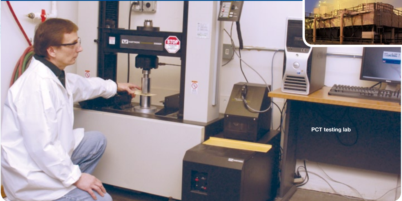
PCT testing lab